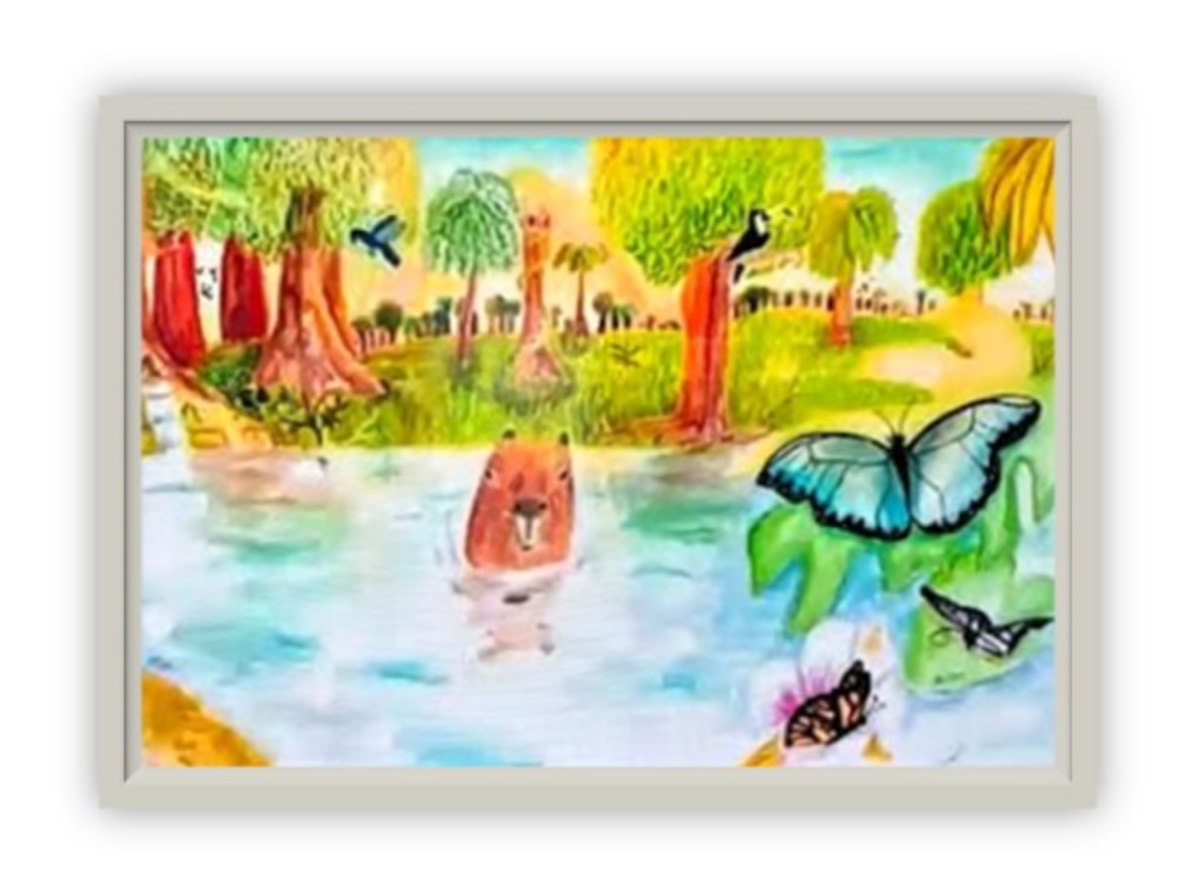
Skool Loop App